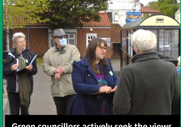
Green councillors actively seek the views of residents.